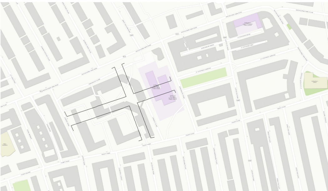
Now, with Burlington Rd and Westmoreland Rd dotted over