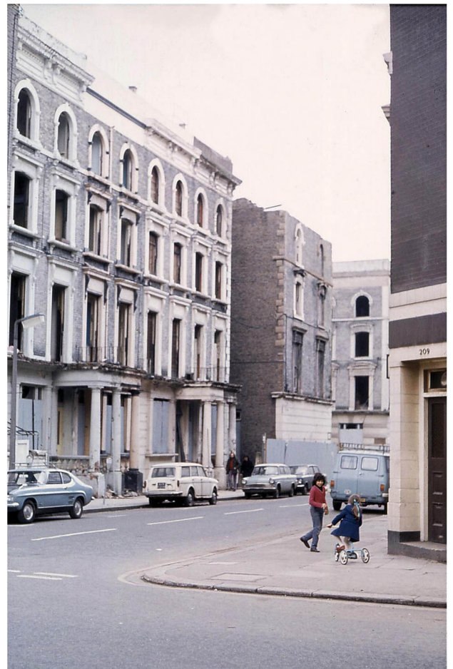
Prior to demolition 1974 looking southeast at top of Ledbury Rd