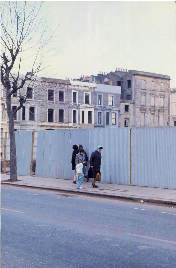
Looking southeast from Westbourne Park Rd towards west end (extended) of St Stephen's Gardens