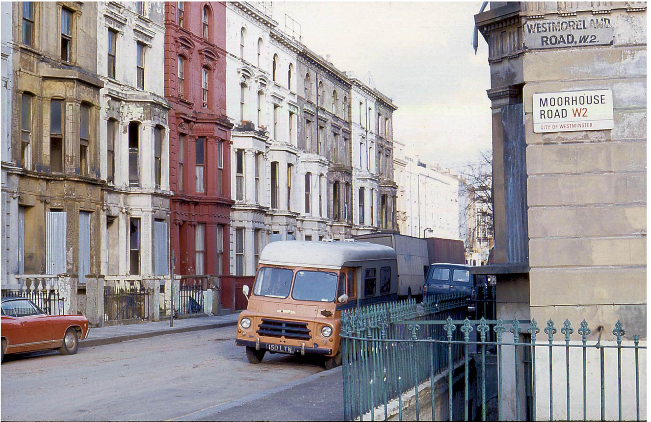
Looking east by northeast from Moorhouse Rd extended north, previously this called Westmoreland Rd. Note: Westmoreland Rd carried on north over a crossroads with Talbot Rd, and then to this illustrated crossroads with Burlington Rd. Burlington Rd later renamed (the western extension of) St Stephen's Gardens