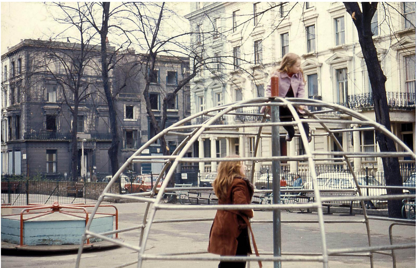
From the south side of 1974 (and current) St Stephens Gdns looking nw onto the eastern corner end of Burlington Rd; lost west facade of Shrewsbury Rd shown, has blue painted trim